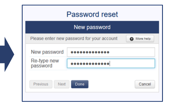
4. Enter your new password. The minimum password length is eight characters. Click "Done"

This function requires you to register with a work email address and have a valid work email address